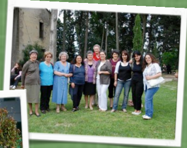
.....some of our friends from La Scala Church